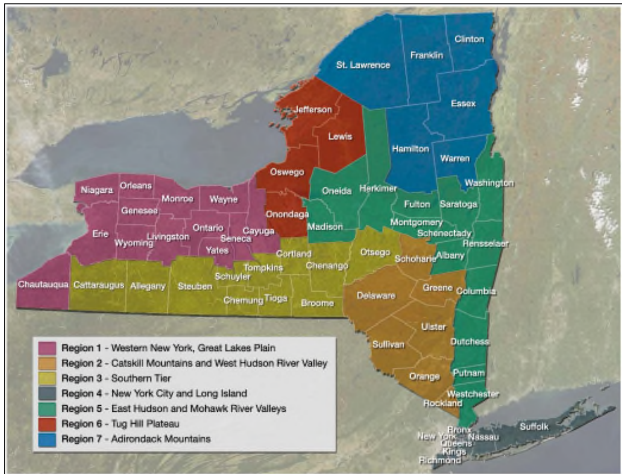
Figure 5.4.6-4. Climate Regions of New York State

Each region in New York State, as defined by ClimAID, has attributes that will be affected by climate change. Warren County is part of Region 7 (see Figure 5.4.6-4), Adirondack Mountains. Some of the issues in this region, affected by climate change, include: loss of high elevation plants, animals and ecosystem types; decline in winter recreation; decline in milk production, etc. (NYSERDA 2011).